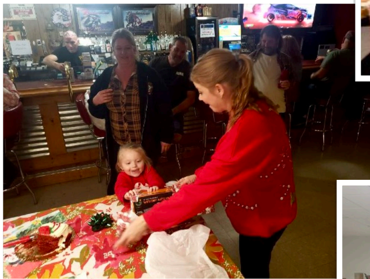
Opening presents at our Post Christmas Party.